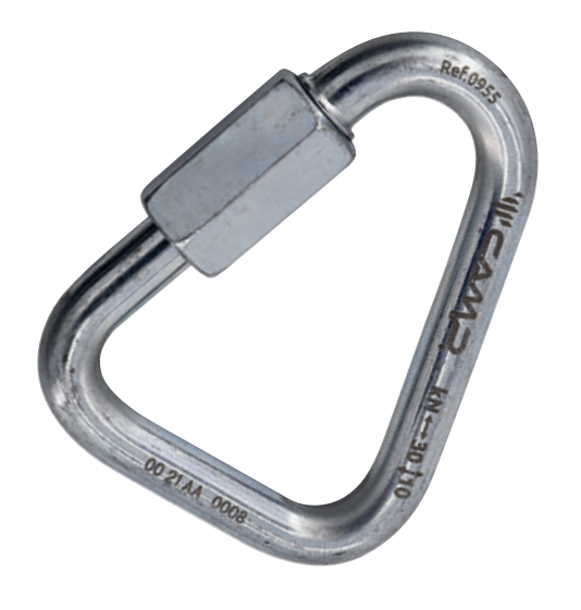
From zinc plated carbon steel