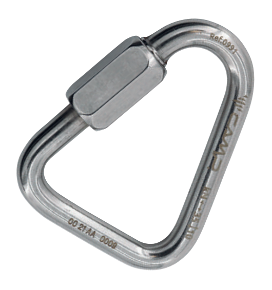
From stainless steel for outdoor installations or corrosive environments.